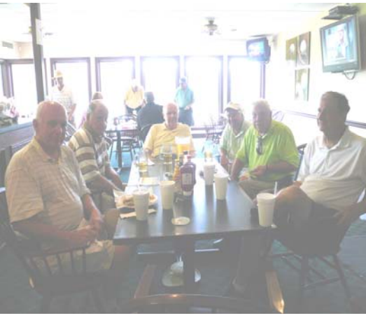
Some of Altadena's members cooling off and relaxing after Senior Monthly.