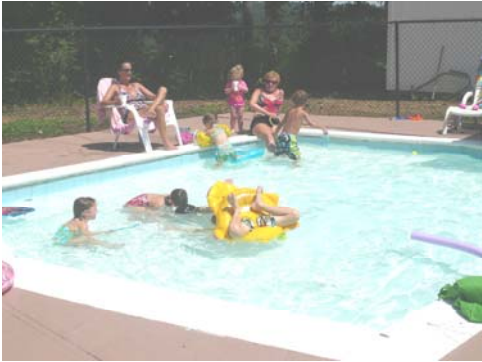
Altadena members enjoying the pool during these HOT, humid Alabama days.